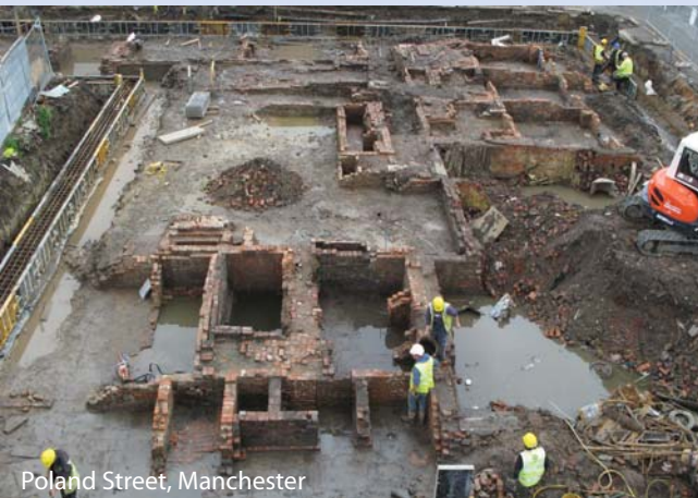
Poland Street, Manchester