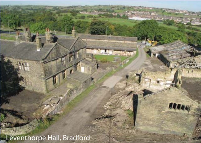
Leventhorpe Hall, Bradford